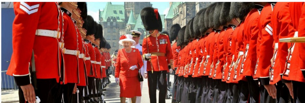
Prepared for the RAC web page