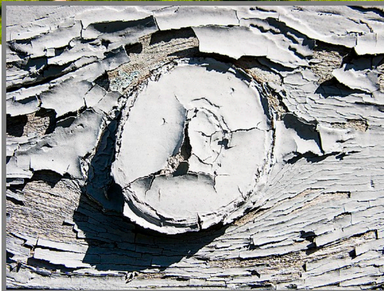
MAY MYSTERY PHOTO